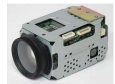
2 Mega Pixel Camera