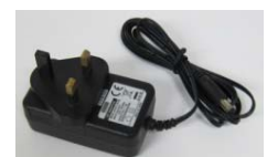
15W External Adapter